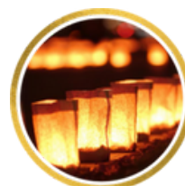
Honor the Memory of a loved one

All items needed for Holy Week are in an online Store! Special Gifts for Great Lent and Holy Week, Holy Week books, Luminaries & Epitaphion. Click HERE for more information.