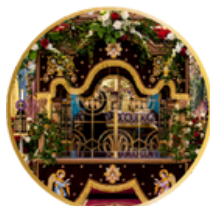
Donate Flowers for the Epitaph