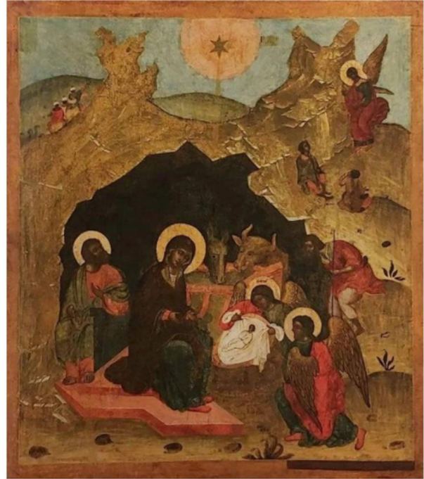
+ ALEXIOS Metropolitan of Atlanta

Yours with paternal love and blessings in our Incarnate Lord,