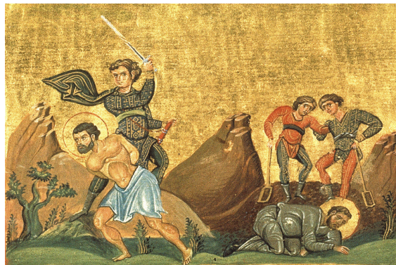
Aitherios the Martyr of Nicomedia