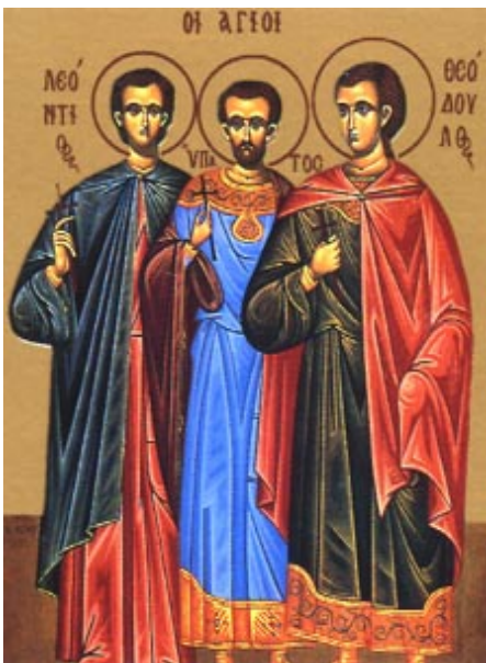
Leontius, Hypatius, & Theodulus the Martyrs of Syria

A protection of Christians unshamable, intercessor to our Holy Maker, unwavering, please reject not the prayerful cries of those who are in sin. Instead, come to us, for you are good; your loving help bring unto us, who are crying in faith to you: Hasten to intercede and speed now to supplicate, as a protection for all time, Theotokos, for those who honor you.