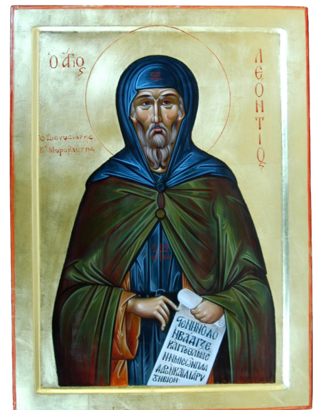
Leontios the Myrrh-Streamer of Argos